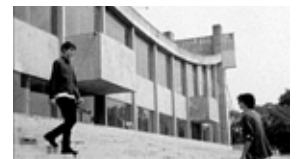
Film Still „El Camino“