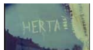
Film Still „Herta“