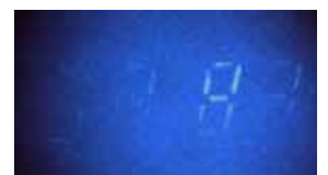
Film Still „Clock from Moscow“