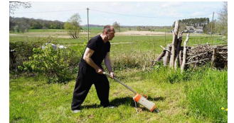
Shade – Lawn – Vacuuming | Schatten – Rasen – saugen