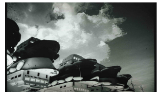
Telemach Wiesinger, Logbuch

The locations are only approximately localized on the basis of longitude and latitude. Telemach Wiesinger is not concerned with the depiction of a specific place, but rather with a general description of travel perceptions. Telemach Wiesinger's analog photographs pictures follow the thought: "The world is a system of signs" – Have a good trip!