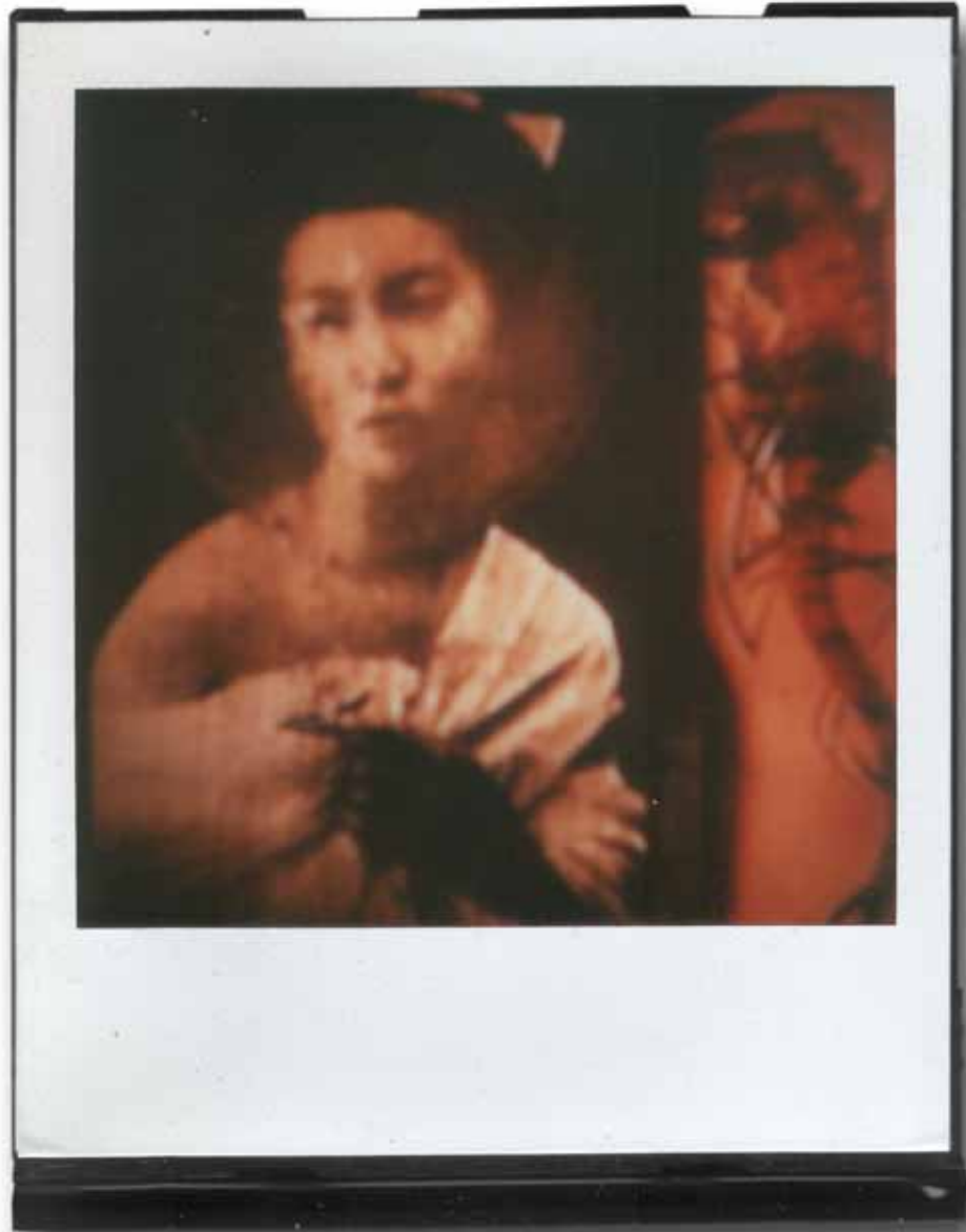
SX 70 Polroid, Geisha being filmed (red), 1990

• contact: dl@directorslounge.net • web: www.arbitraria.tumblr.com