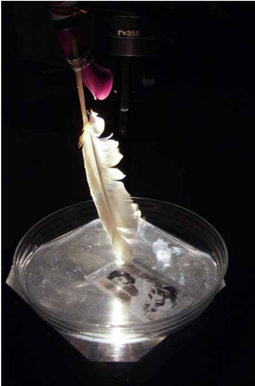
The Dream Of The Japanese Beauty, 2009 Installation, overhead transparency, water, feather, vibrator, light, dimensions variable

• contact: dl@directorslounge.net • web: www.arbitraria.tumblr.com