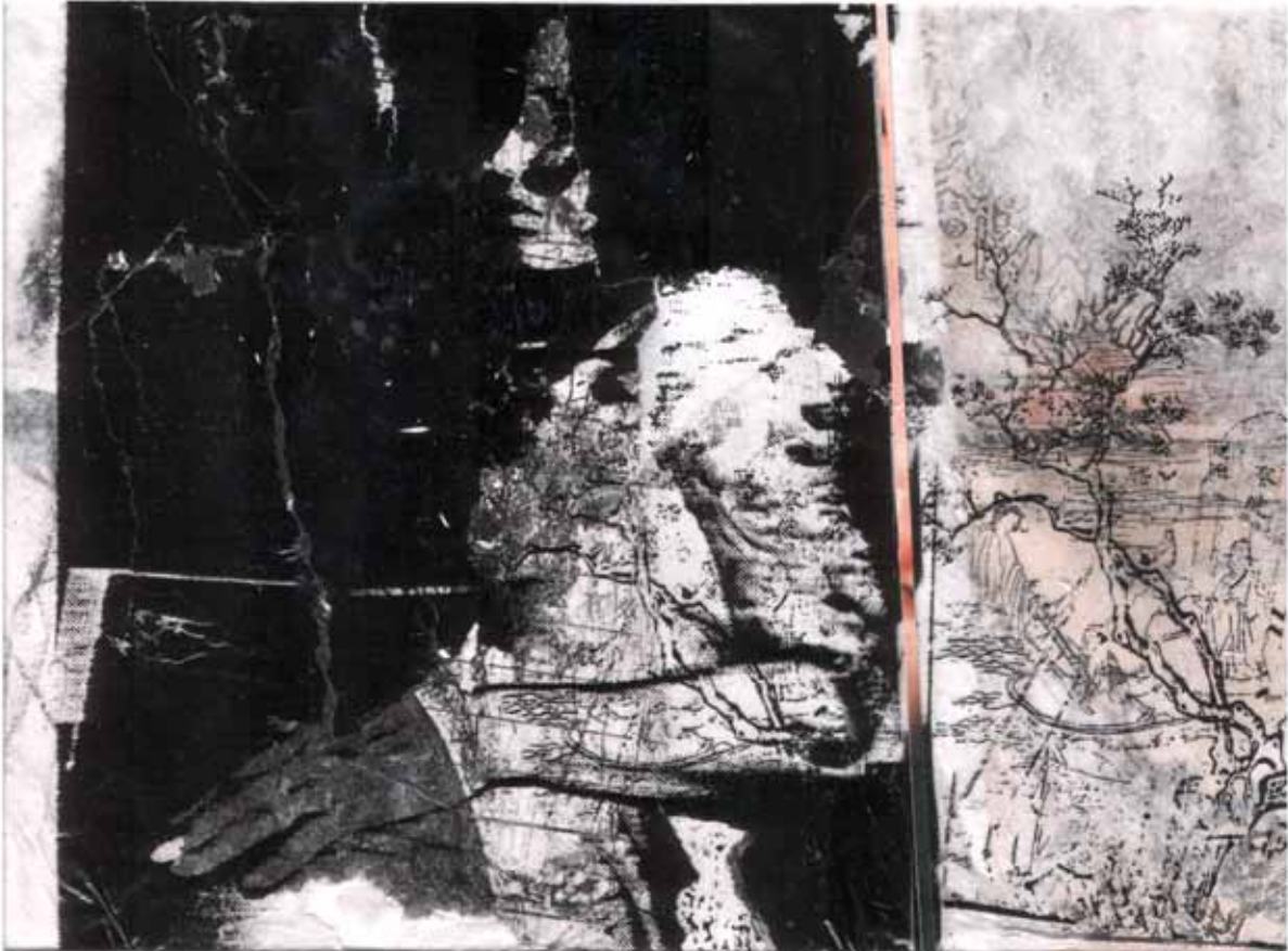
untitled, phototransfer/collage, 11 x 16,1 cm (as cibachrome, 200 x 136 cm) 1992