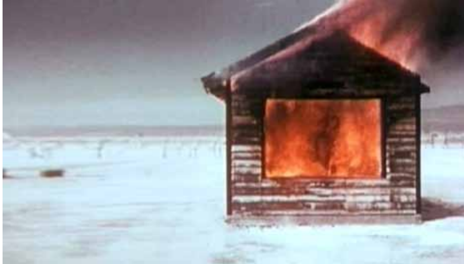
Mannaka No Ie (The House In The Middle) 7 min 50s, 2006