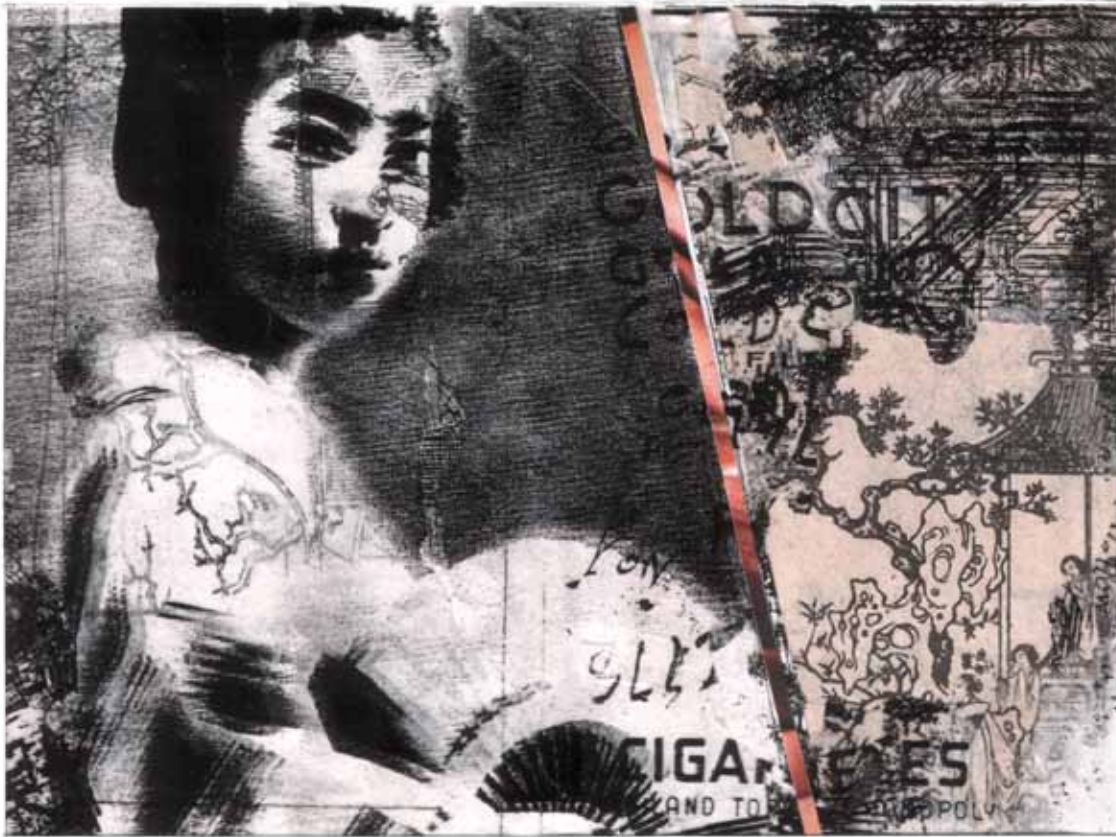
untitled, phtototransfer/collage, 11 x 16,1 cm (as cibachrome, 200 x 136 cm) 1992

Just like in the story of Mr. Spinell 1 , who always averts his eyes in reflex when beholding something beautiful, such that only the arc of his eyelashes catch a glimpse of that which he decided to turn down. The view of what could have been seen after this abrupt decision doesn't reach the iris, because it is being warded off by quick eyelids, lowered protectively. Within the security of his closed lids, Mr. Spinell imagines what acts of beauty and harmony might have unfolded outside; it all unfolds and takes shape, having been inspired by the minute glimpse of this awesome beauty that Mr. Spinell didn't have the courage to observe in its entirety. The glance he invested served to gather enough information about this beauty to embellish it afterwards in his mind's eye. This glance was cast in but a brief moment: Coup d'oeil. One might also say that the picture, donning the promise of beauty, had thrown itself upon Mr. Spinell's eyes, and that he had felt compelled to close his eyes to avoid this invasion, to avoid having to recognize this beauty.