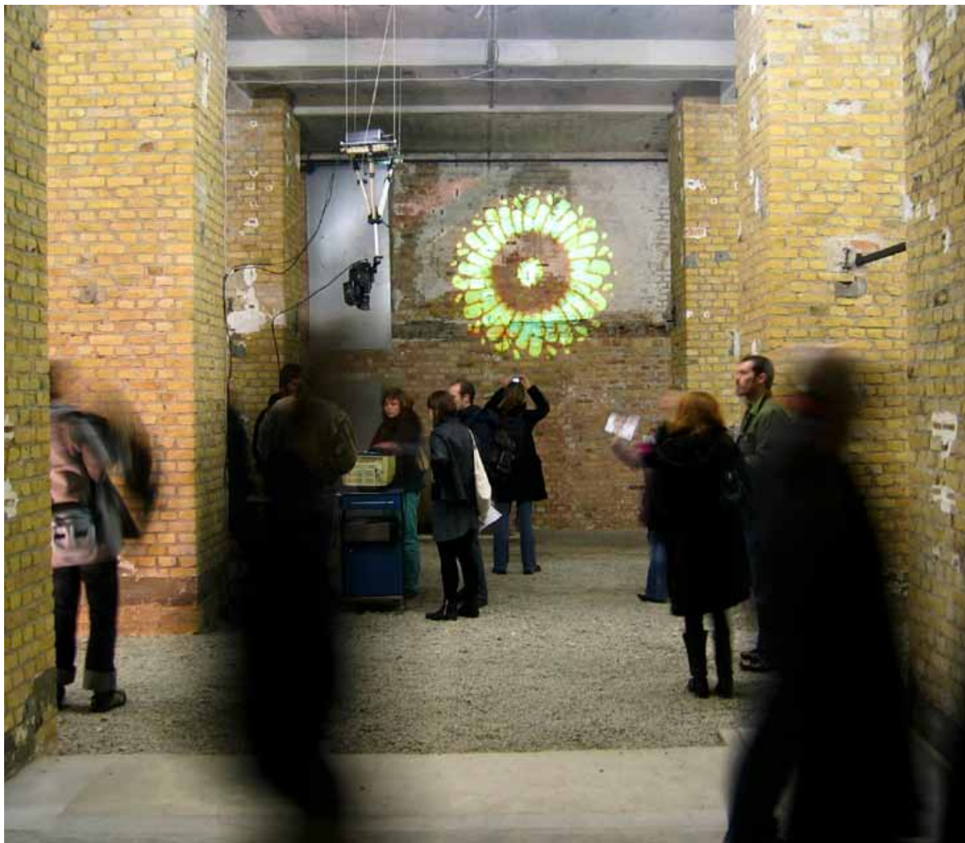
parole soleil, 1989, interactive closed-circuit Installation, camera, bw tv set, beam, dimensions variable 5th Berlin Kunstsalon, art fair, 2008

• contact: dl@directorslounge.net • web: www.arbitraria.tumblr.com