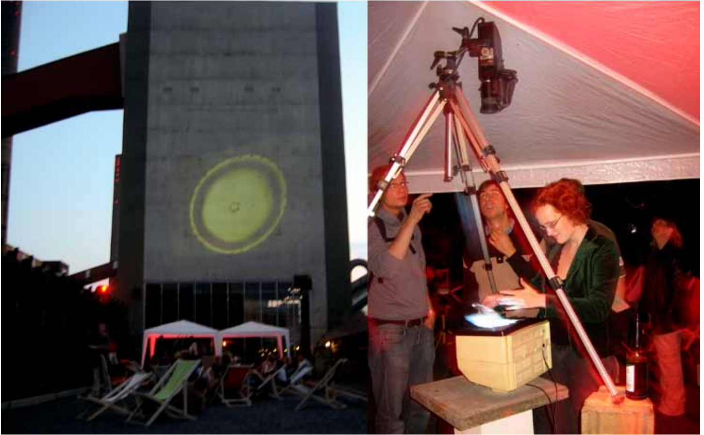
parole soleil, 1989, interactive closed-circuit Installation, camera, bw tv set, beam, dimensions variable Extraschicht / c.a.r. Zollverein world heritage site, 2008

• contact: dl@directorslounge.net • web: www.arbitraria.tumblr.com