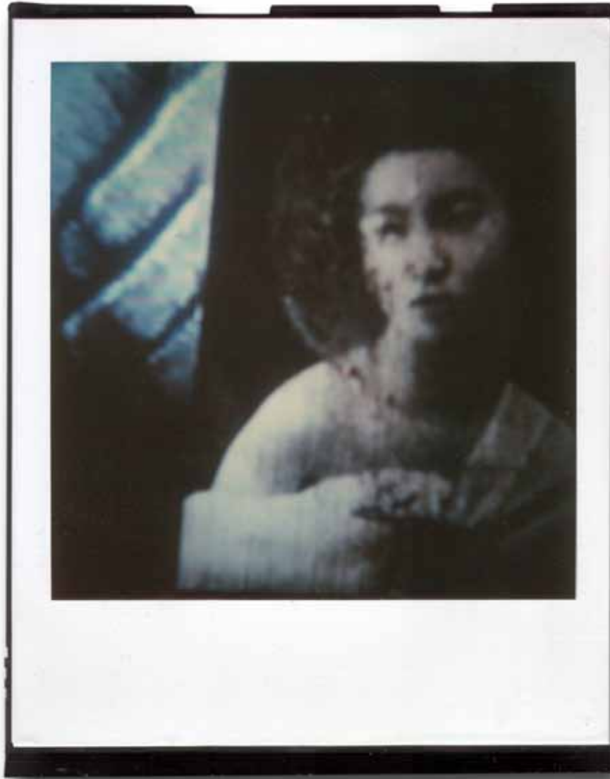
SX 70 Polroid, Geisha being filmed (blue), 1990

• contact: dl@directorslounge.net • web: www.arbitraria.tumblr.com