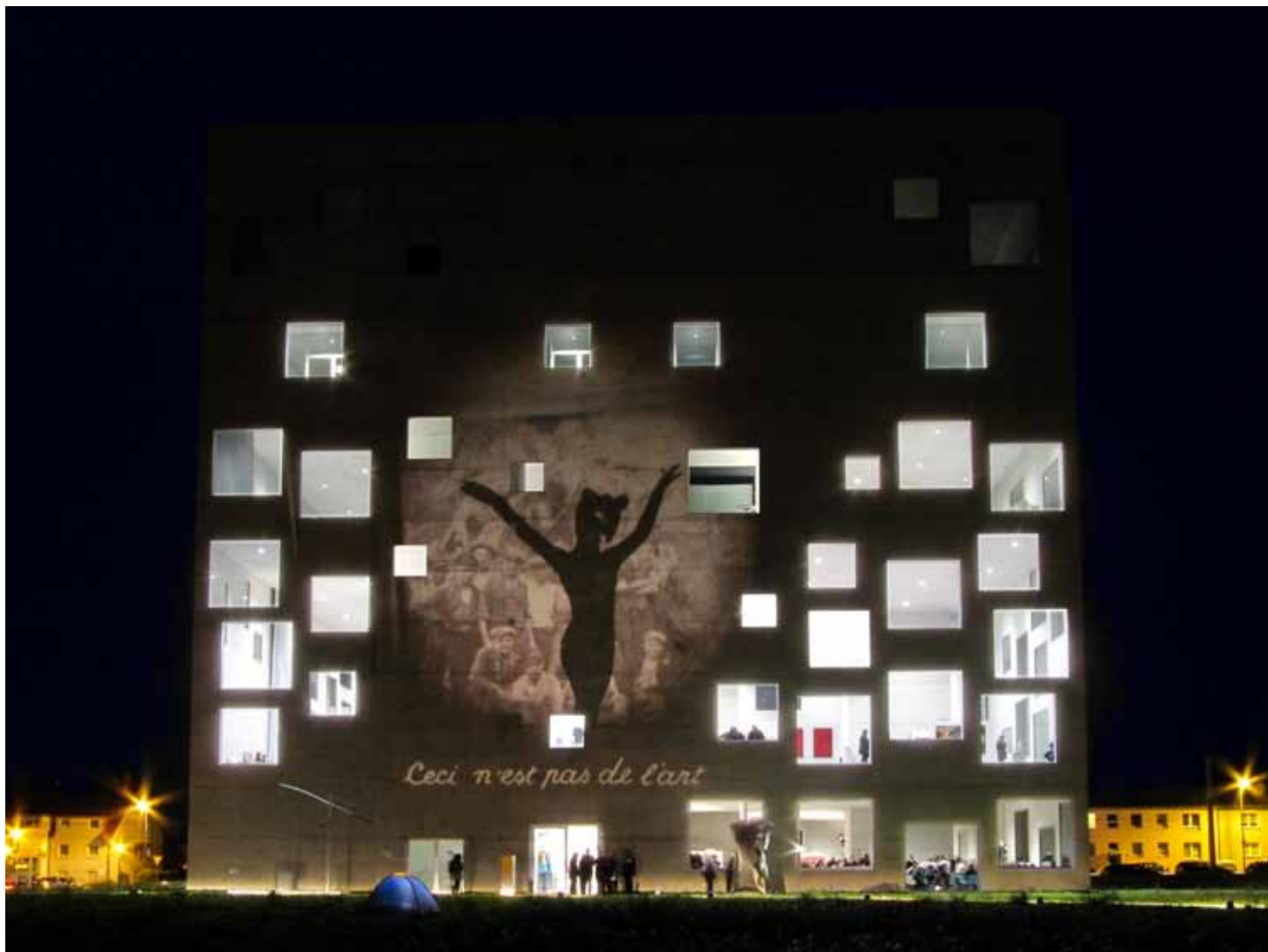
Ceci n'est pas de l'art, shown as part of the opening of the c.a.r. 10, the contemporary art Ruhr fair

• contact: dl@directorslounge.net • web: www.arbitraria.tumblr.com