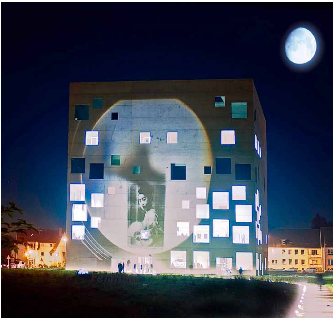
The Dream Of The Japanese Beauty, shown as part of the opening of the c.a.r. 09, the contemporary art Ruhr

• contact: dl@directorslounge.net • web: www.arbitraria.tumblr.com