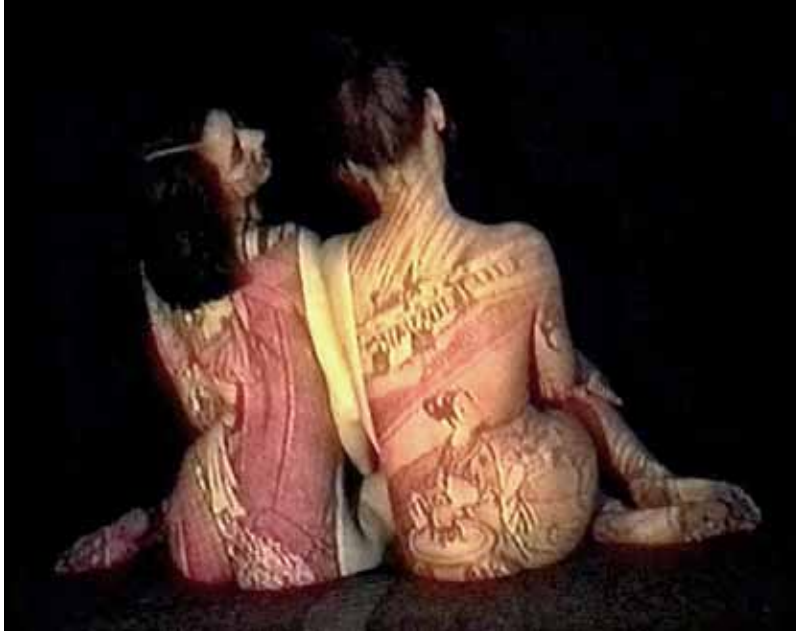
Pearls of the morning dawn, video installation, single channel, looped 1993

In some videos, A. acts as a maker of tatoos. The meaning of “imprinting” is taken literally, as recordings of naked bodies are being covered with diverse scriptures by means of electronic manipulation. But instead of creating some sort of literariness of the body, the opposite is achieved. The projected layers of script are mere fragments, devoid of meaning or coherence. These chaotic scribbles turn the “everlasting signs,” as created by the art of tatooin, into ephemeral, shifting, and empty signs. Their sole purpose, it seems, is to hold no meaning, or, more accurately, nothingness. The body is released from the chains of being a symbol, of holding meaning: Instead, it has become a medium for constant change, depicting the nature of life, pointing to the river of reality.